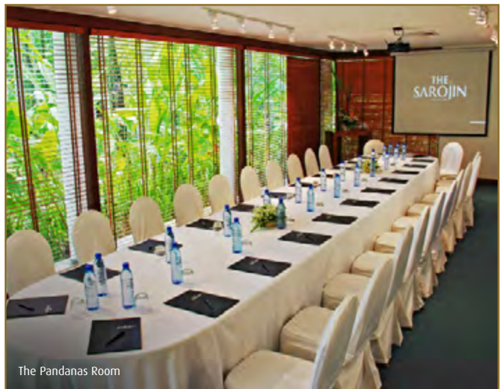
The Pandanas Room

The Beach, Ficus, Edge and The Lawn – Ideal venue for dining function, cocktail party, wedding ceremony and reception