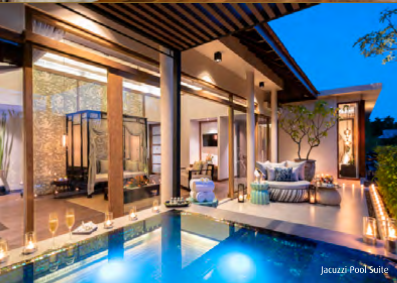
Jacuzzi Pool Suite