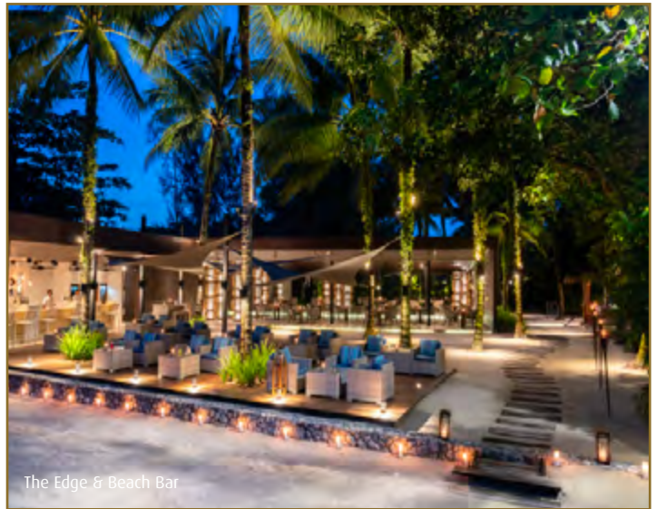
The Edge & Beach Bar

Breezy, chic and stylish, with spectacular views across its gorgeous beach and sea views. Dine on Thai and seafood delicacies, sink into tropical inspired loungers or comfy sofas - perfect for sipping a chilled cocktail or just relaxing.