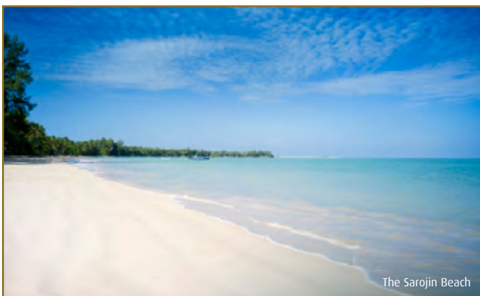
The Sarojin Beach

Situated just an hour from Phuket International Airport in Khao Lak on a secluded 11km white sandy beach. Ideal for couples, romantic breaks, honeymoons, weddings and older family groups. Designed in a contemporary Asian style with just 56 luxurious guest residences. Wide range of activities and facilities – snorkel, SCUBA or cruise on a luxury boat, jungle adventures complete with champagne, glimpse authentic Thai local life in association with responsible and sustainable tourism commitment, rejuvenating spa massages lulled by the sounds of the Andaman sea, Thai cooking classes, lazy gourmet lunches, romantic dinners on a secluded beach or by a candlelit jungle waterfall ...the limits are only your imagination. No children under 10 years permitted to stay.