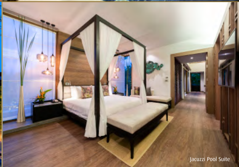
Jacuzzi Pool Suite