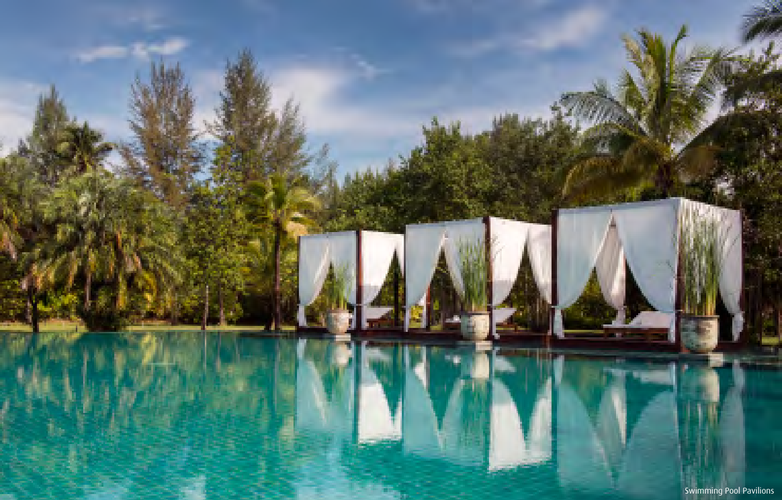
Swimming Pool Pavilions