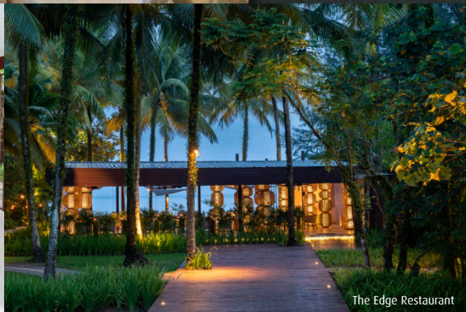
The Edge Restaurant