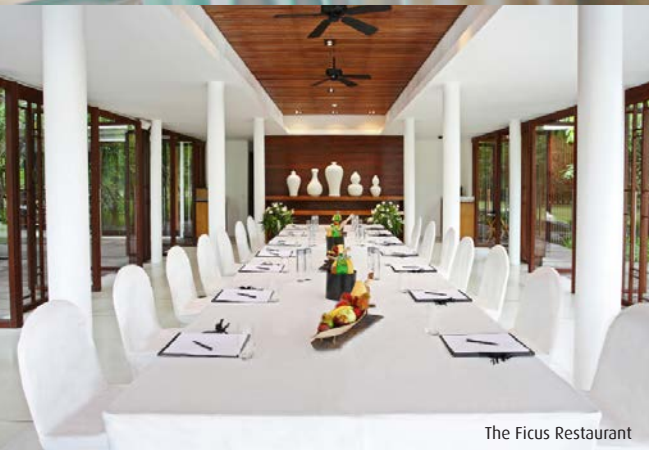
The Ficus Restaurant