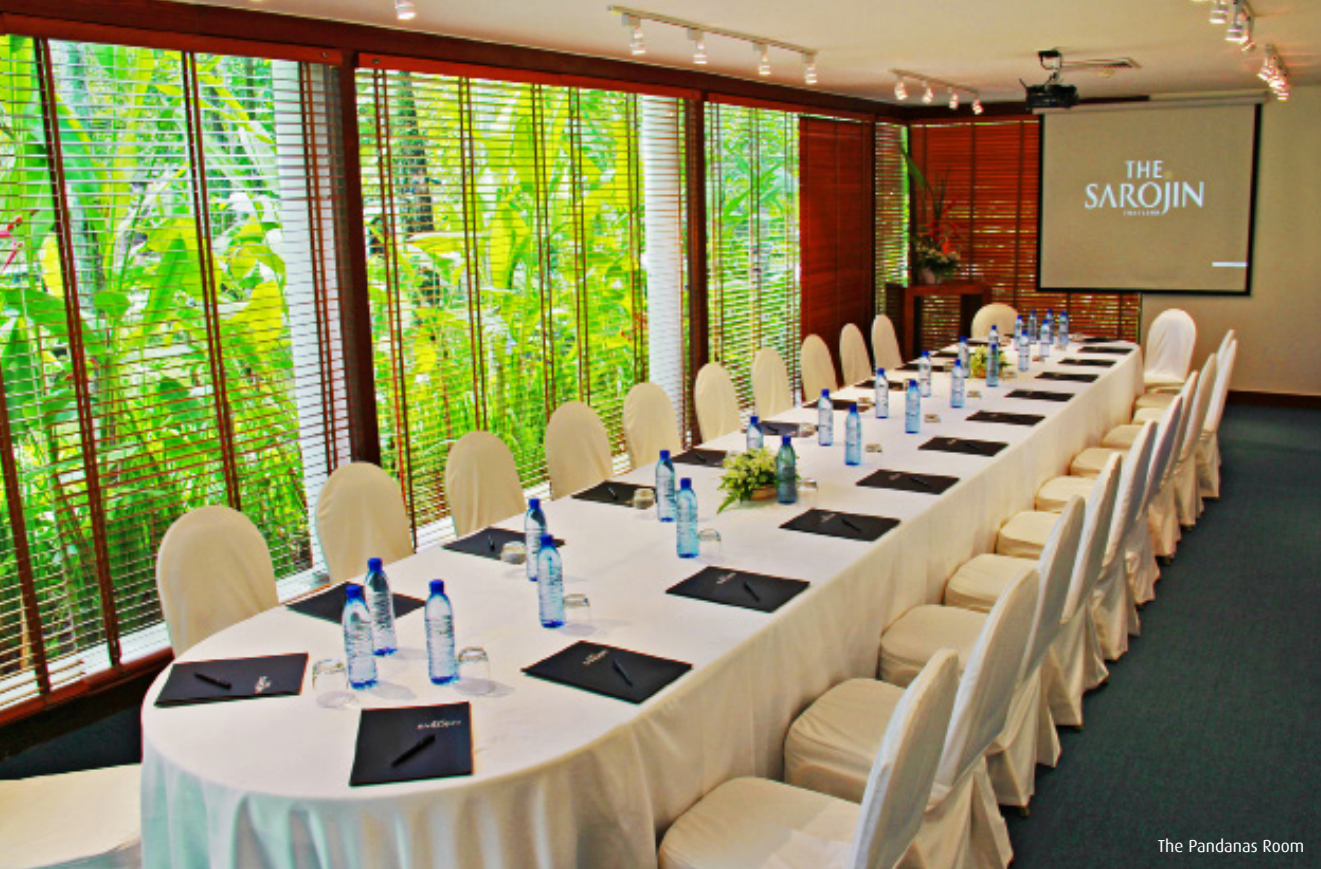
The Pandanas Room