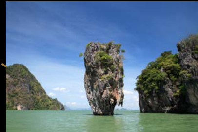
Phang Nga Bay