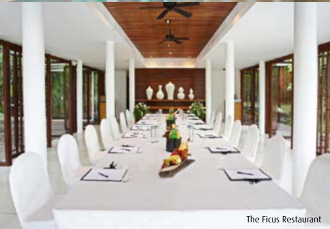
The Ficus Restaurant