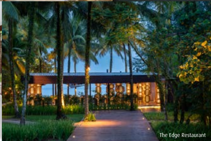
The Edge Restaurant