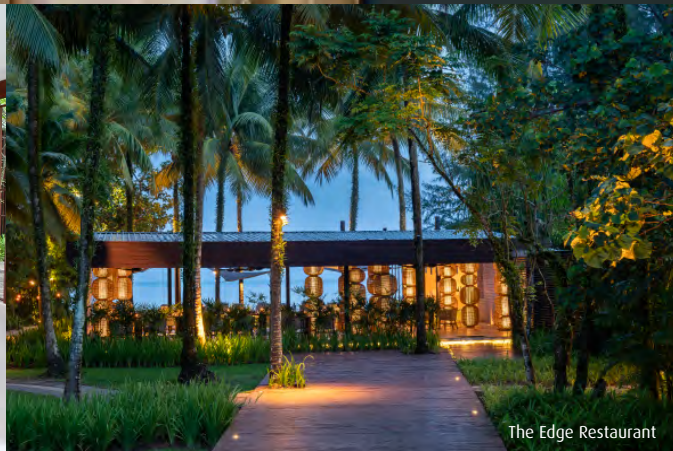
The Edge Restaurant

The Sarojin provides the following equipment on a complimentary basis