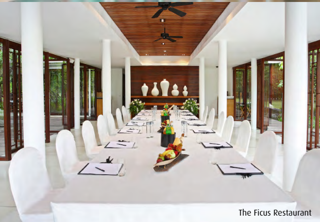
The Ficus Restaurant