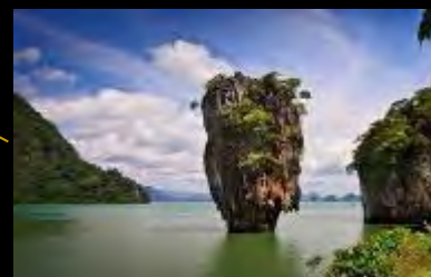
Phang Nga Bay