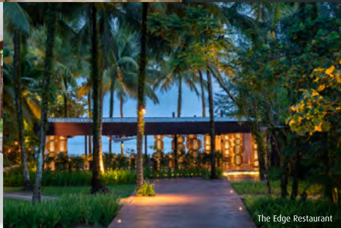
The Edge Restaurant

The Sarojin provides the following equipment on a complimentary basis