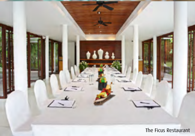
The Ficus Restaurant