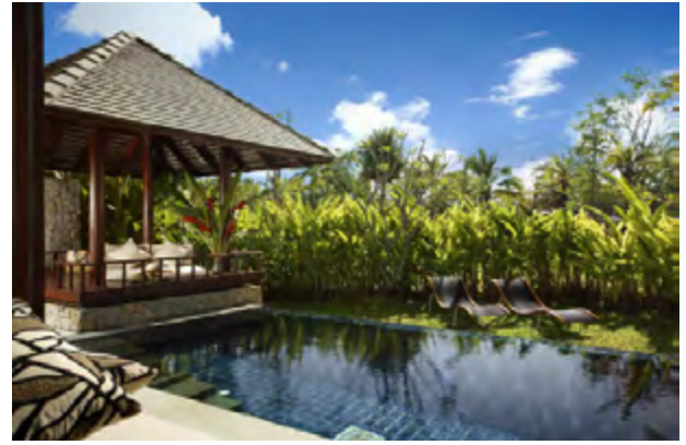
pool residence (120 sq.m) 3.5m x 5.5m pool