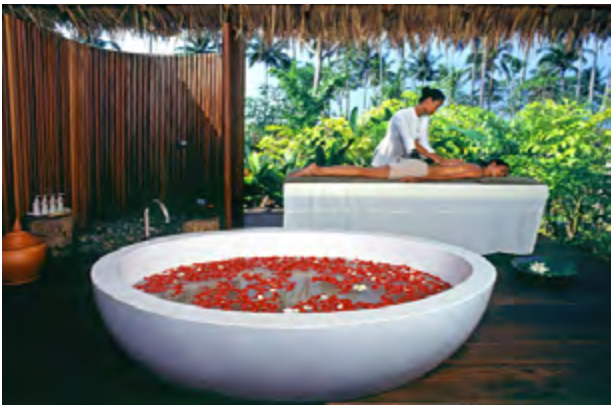
spa - a rejuvenating spa massage lulled by the sounds of the andaman sea