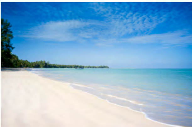
11km secluded beach - endless walks, year round swimming and watersports