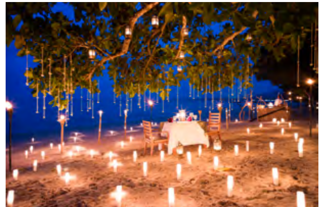
a secluded beach, private sand isle, a candlelit jungle waterfall...your choice