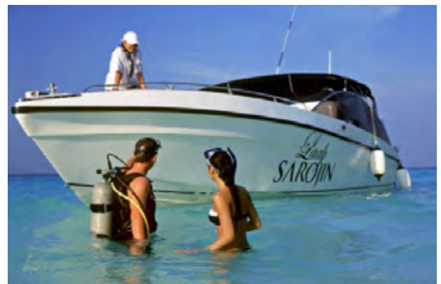
similan & surin islands - snorkel, SCUBA phang nga bay - sea cave canoes, snorkel