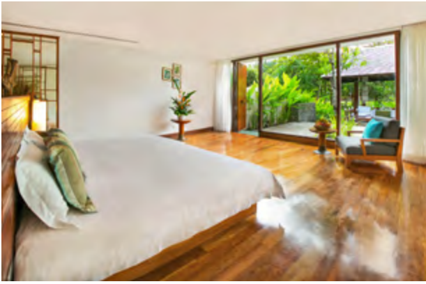
garden residence (95 sq.m) couples bathroom, sun terrace, Thai sala