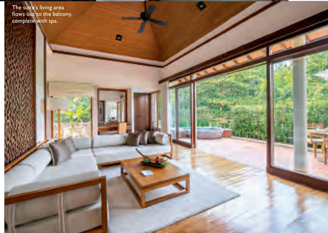
The suite's living area flows out to the balcony, complete with spa.

For more details, go to www.sarojin.com .