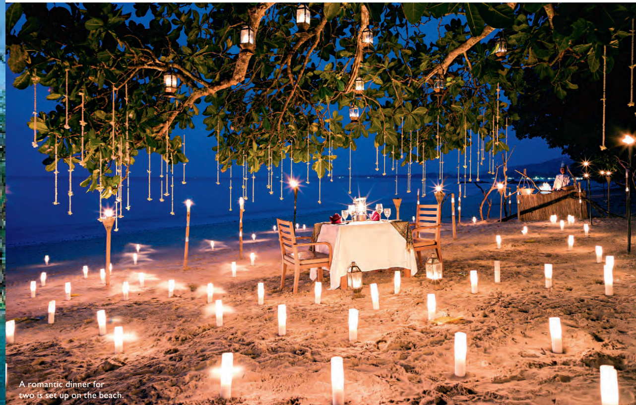
A romantic dinner for two is set up on the beach.