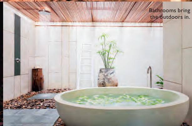
Bathrooms bring the outdoors in.

Arriving at the five-star Sarojin resort feels a bit like walking onto a film set. It's 11.30pm, and although I'm weary-eyed from two flights, I immediately find a burst of energy on arrival. The backdrop to this setting is a tropical oasis: palm trees aplenty in the richest hue of green and paths of stepping-stones that wind into the unknown. You could say it's the world of Willy Wonka for grown-ups: a fantasy sensory overload made all the more memorable for me by the fresh pandanus juice I'm sipping. In that moment, I briefly ponder how the plant life appears to be hovering over the lotus pond, but not for long (I'll work that out in the clarity of daylight). Right now, I'm more than happy to succumb to the notion that this vision is so perfect, it can't be real.