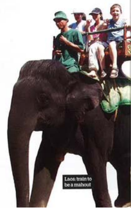
Laos: train to be a mahout