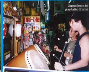
Japan: learn to play taiko drums