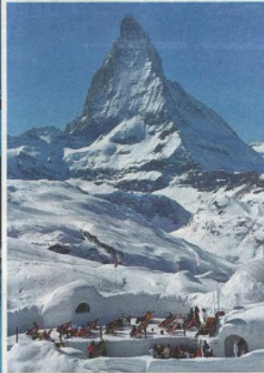
Room for two (clockwise from main) the Sarojin's island escape; Annes Grove, Co Cork; Igloo Dorf; the Montbazillac treehouse