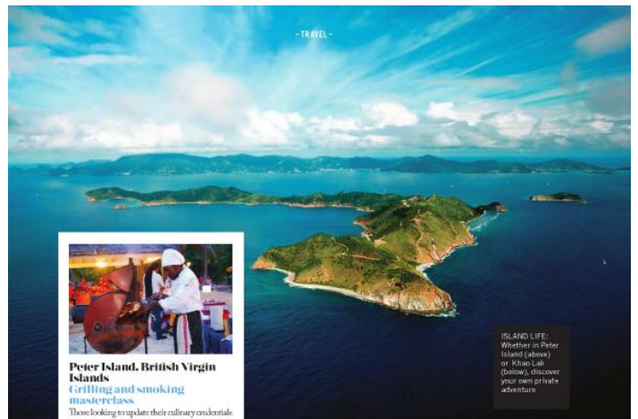
- TRAVEL -