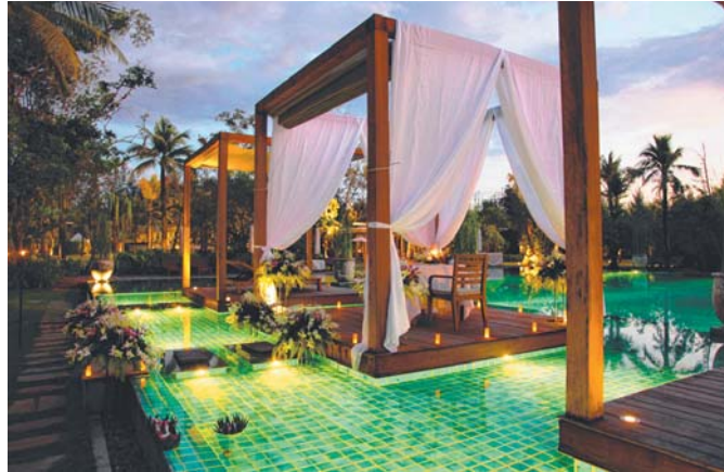
INTIMATE: A private dining pool at the Sarojin, Thailand (above); and a private pool and spa villa at Ayana Resort & Spa, Bali (left).

FEEL the love on a six-night Hawaiian honeymoon package priced from $1990 a person staying at the Hyatt Regency