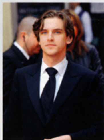
VIP TRAVEL DAN STEVENS Actor and star of Downton Abbey