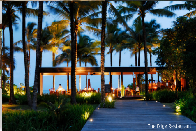
The Edge Restaurant