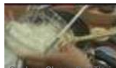
Cookery Class - Pad Thai Cookery...