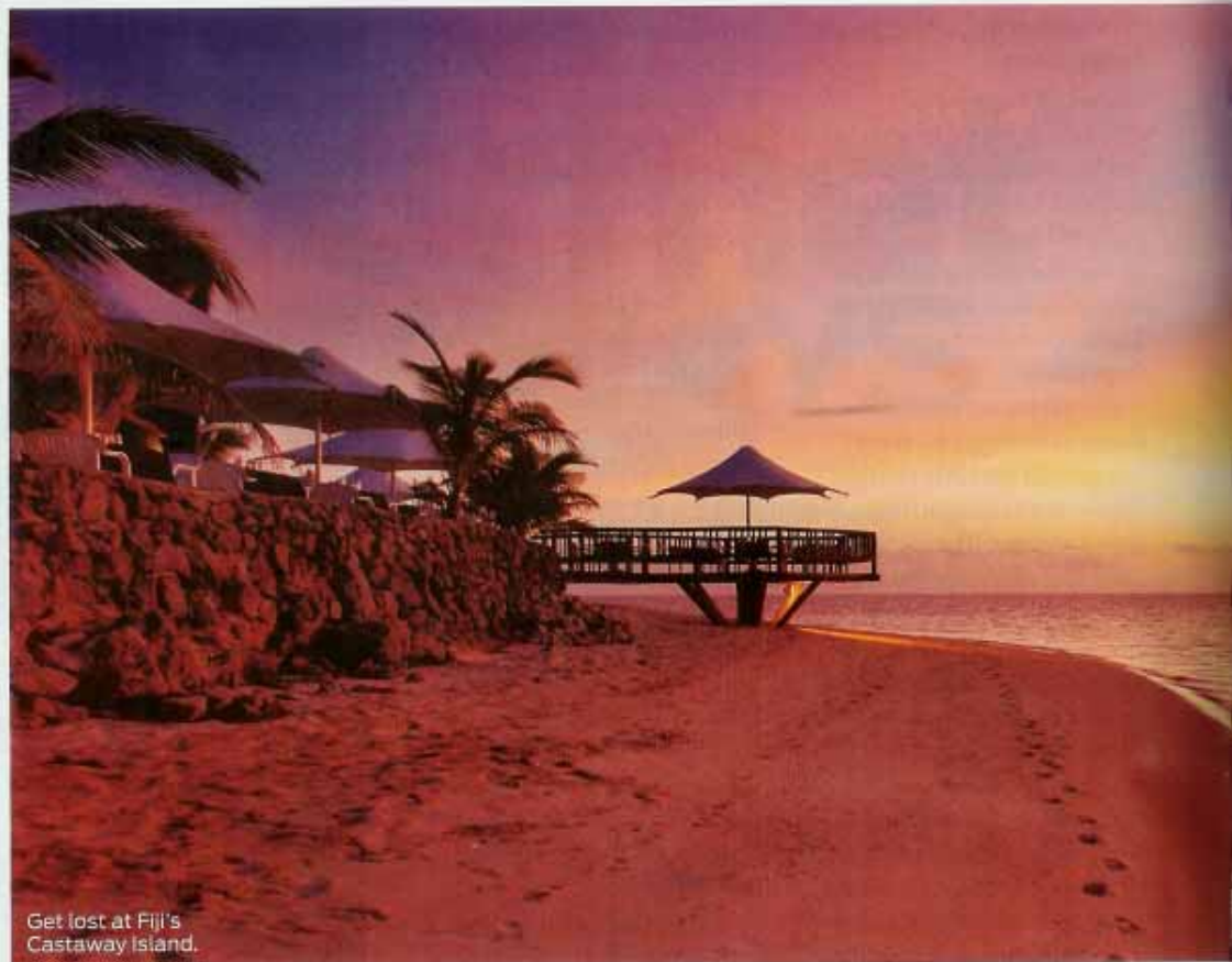
Get lost at Fiji's Castaway Island.

It's one of the prettiest of the Mamanuca group