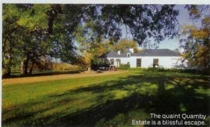
The quaint Quamby Estate is a blissful escape.

best wineries in the Tamar (Three Wishes, Goaty Hill, Holyman), gourmet dinners matched with standout local wines and a farm gate tour of outstanding regional artisan food producers, including a truffle farm in season. Meals are enjoyed at restaurants including Launceston's iconic Stillwater and Strathlynn. quambyestate.com