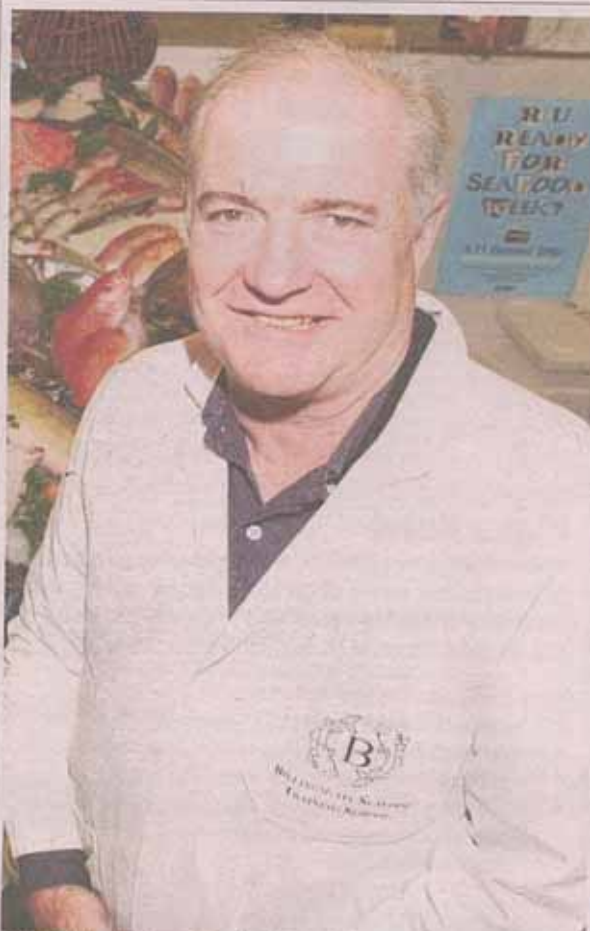
Rick Stein: 'Swimming in the sea in north Cornwall on a sunny summer's morning is pretty close to heaven'

Turning left when I get on board a plane.