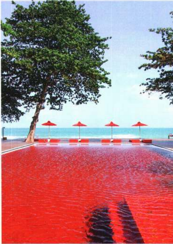
The Library: gaze at the horizon from the vermillion-tiled pool or relax amid elegant minimalism (left and below)