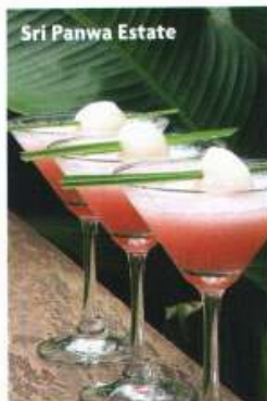
Sri Panwa Estate