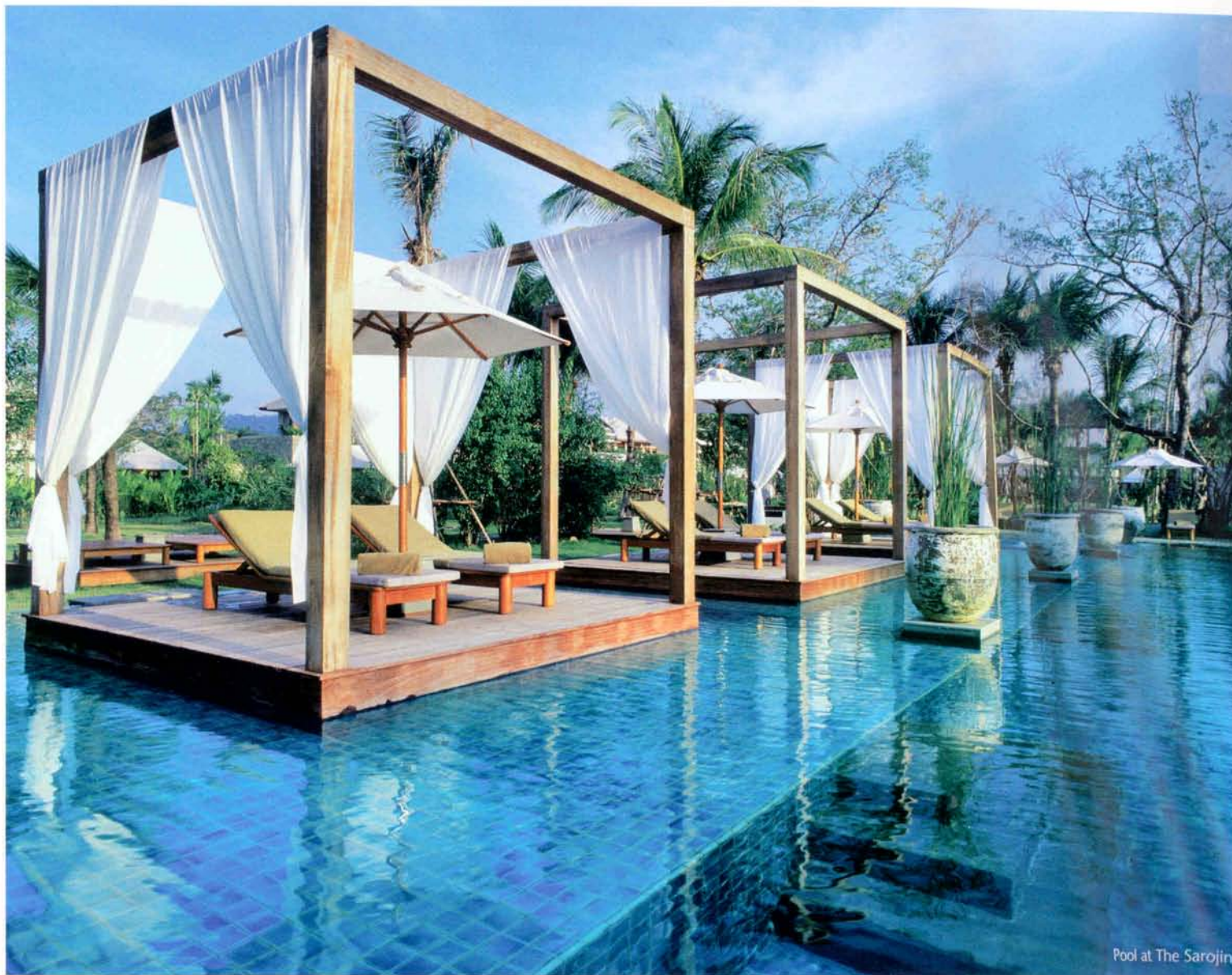
Pool at The Sarojin