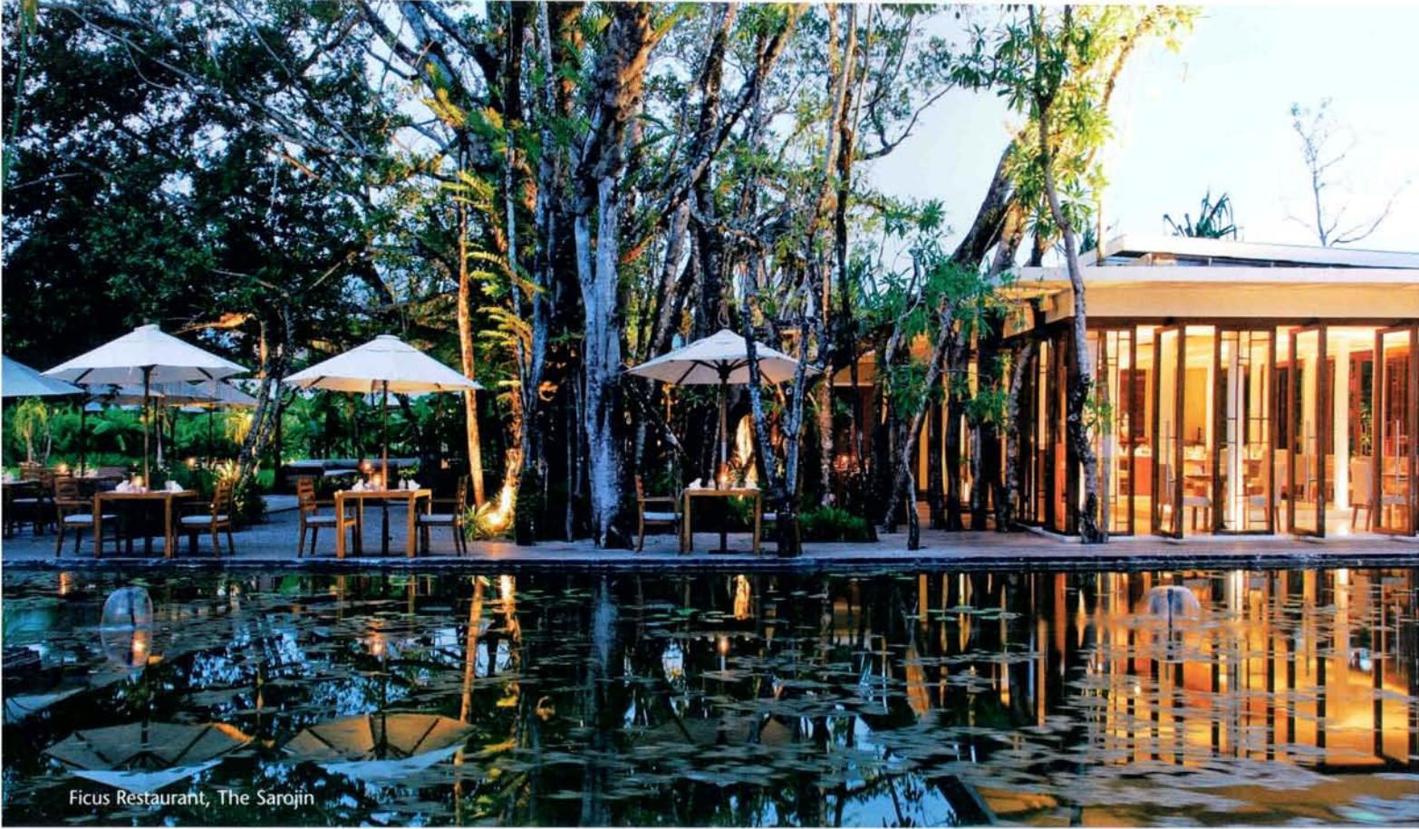
Ficus Restaurant, The Sarojin