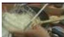
Cookery Class - Pad Thai Cookery...

There are so many things you can do in the beautiful island of Phuket, Thailand. Check out our best outdoor activities list for more ideas.