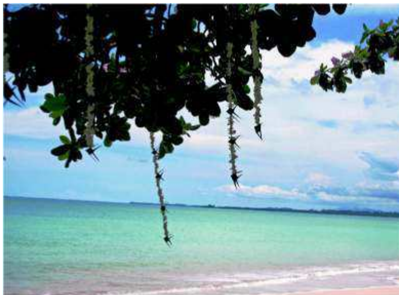
Orchids decorate the sea almond on the beach.

I swim alone in the rock pool below the Rainbow Waterfall in an impossibly beautiful scene.