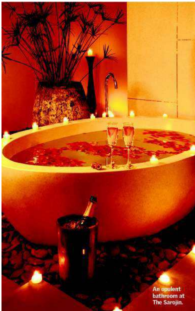
An opulent bathroom at The Sarojin.