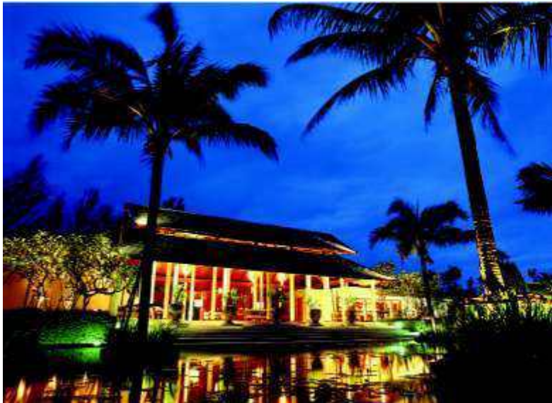
The lights of The Sarojin lobby contrast with the moody night sky.