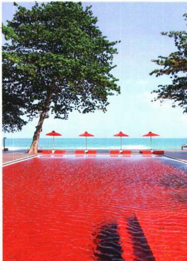
The Library: gaze at the horizon from the vermillion-tiled pool or relax amid elegant minimalism (left and below)